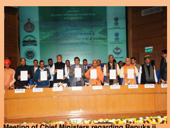
Meeting of Chief Ministers regarding Renuka ji Dam Project

In this project 90 percent cost of power component is being borne by Delhi government, Himachal would get about 200 million units of electricity at Rs. 0.30 per unit only. It would earn net revenue of about Rs. 60 crore per annum to HPPCL and Rs. 12 crore to the state government in its first year of operation.