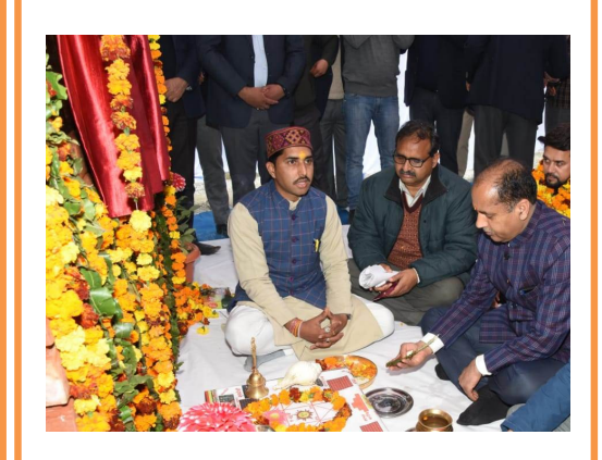
Bhoomi Pujan being performed by Chief Minister at the Project site