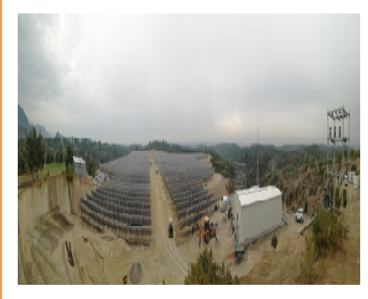
View of 5 MW Berra Dol Solar Power Project