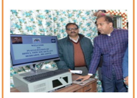
Chief Minister pressing the inauguration botton of the Project